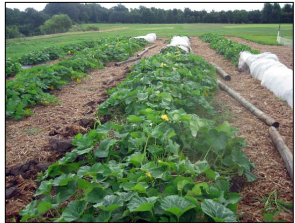
Figure 1. Row cover treatments in plot during anthesis (above) and after anthesis

Thanks to Nick Howell, the ISU Horticulture Farm crew, and the Gleason field crew for crop planting, maintenance and harvest.