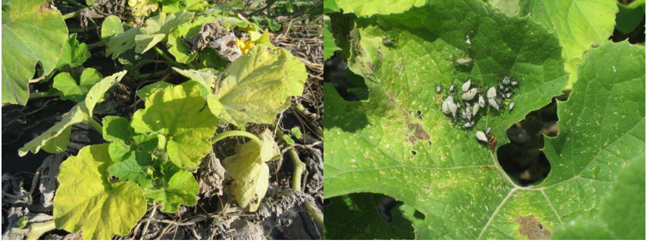
Figure 3. Yellow vine decline (symptoms left) was newly discovered in Iowa and is vectored by squash bugs (right).