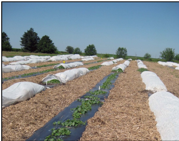
Figure 1. Organic practices muskmelon plot at anthesis. Note that ends of row cover are

Thanks to Nick Howell, the ISU Horticulture Farm crew, and the 312 Bessey field crew for crop planting, maintenance and harvest.